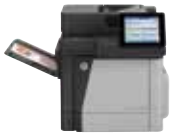
HP Color LaserJet Enterprise MFP M680dn

Tackle high-volume jobs with a high-performance color MFP. Print and copy on letter and A4, plus scan and fax. Enhanced scanning and an 8-inch color touchscreen streamline workflows. Mobile printing options help you stay productive on the go. 2,8