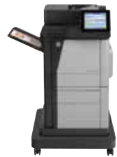
HP Color LaserJet Enterprise MFP M680f