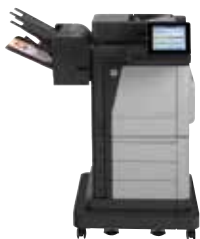
HP Color LaserJet Enterprise Flow MFP M680z