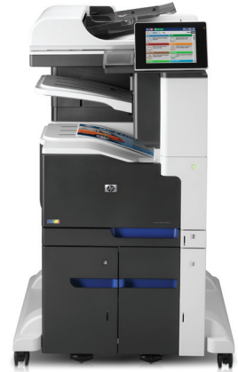
(HP LaserJet Enterprise 700 Printer M775z+)

Mobile printing capability: 3 HP ePrint, Apple AirPrint™